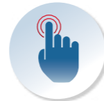
Ease of use